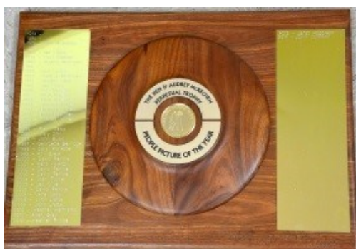
"People Picture of the Year"