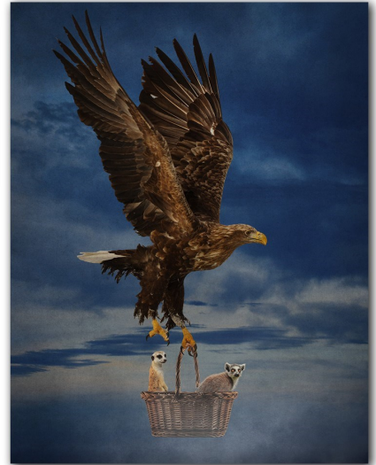
'Blue, Bird & Basket' by Kerry