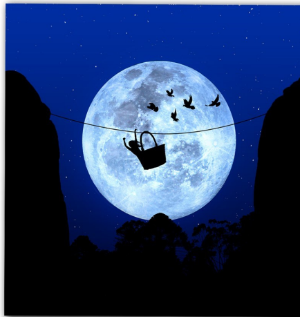
'Blue, Bird & Basket' by Heather P