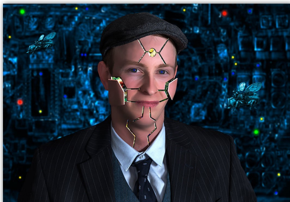
Cyborg by Ketut