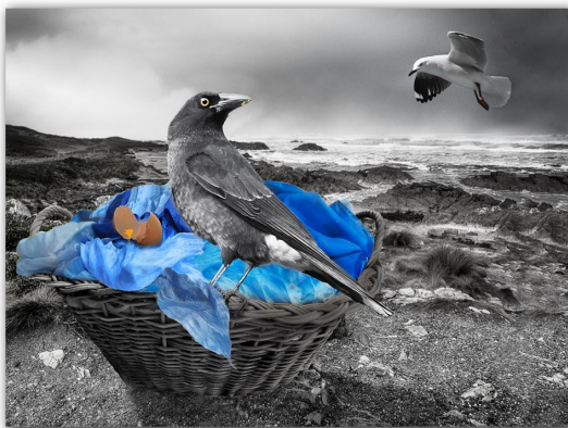
'Blue, Bird & Basket' by Chris